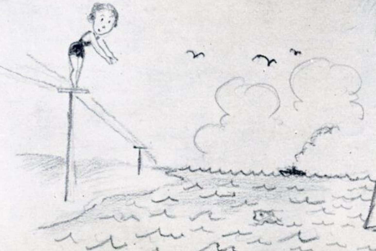
CAPLEN, BEACH COLONY, GETS ELECTRIC SERVICE