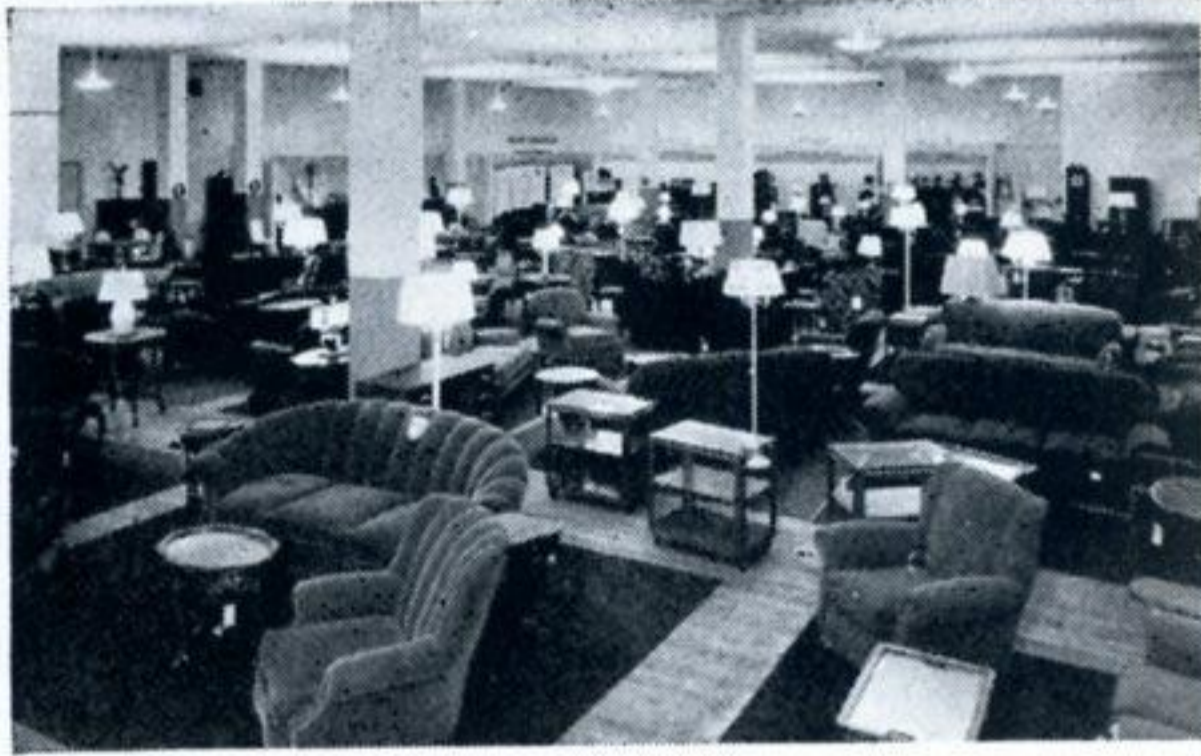
Phoenix Furniture Company, left, utilizes indirect lighting in such a manner as to make shopping in their new store at 700 Pearl Street a pleasure.

More and more business firms are becoming better-light conscious. As they remodel their stores or offices, they realize the vital necessity of better lighting as an important factor in the program, in order to maintain highest efficiency and keep in step with modern progress.