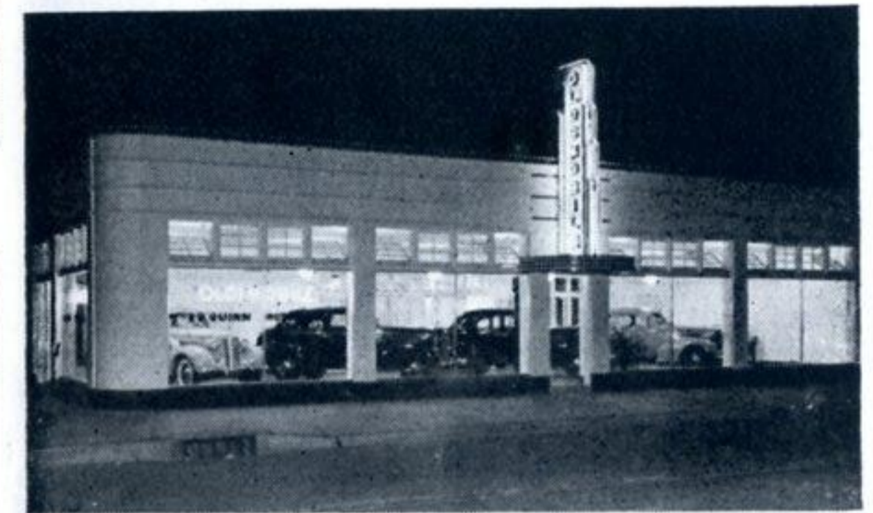
O'Quinn Motor Company, above, puts good lighting to work in helping the sales of Oldsmobiles.

T. V. Smelker & Company conserves its workers eyesight and energy by providing a good system of indirect lighting for comfortable seeing, as shown above.